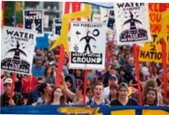
Winnipeg, Canada, 2016