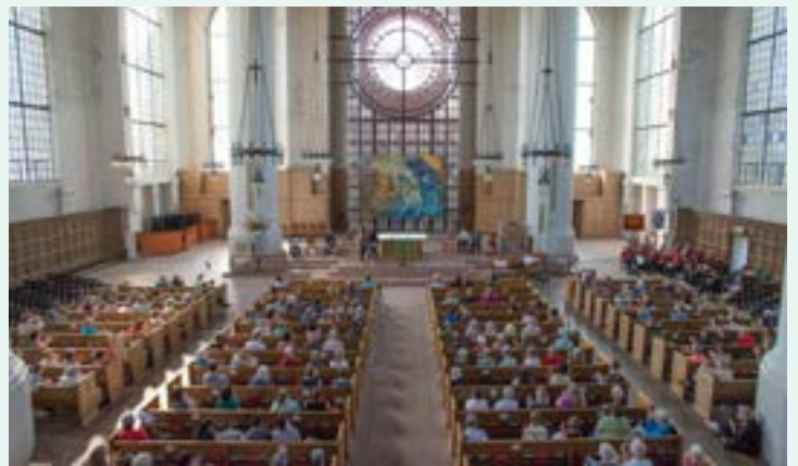
ST MARK'S CATHEDRAL, SEATTLE, 2016