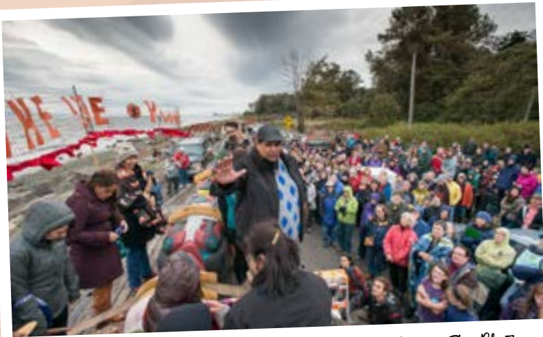
Tsilil-Waututh Nation kicking off the 2013 Totem Pole Journey