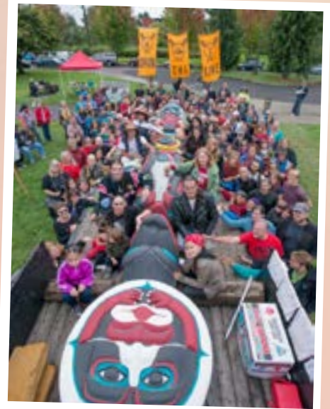
Community Blessing Cathedral Park, Portland, 2013