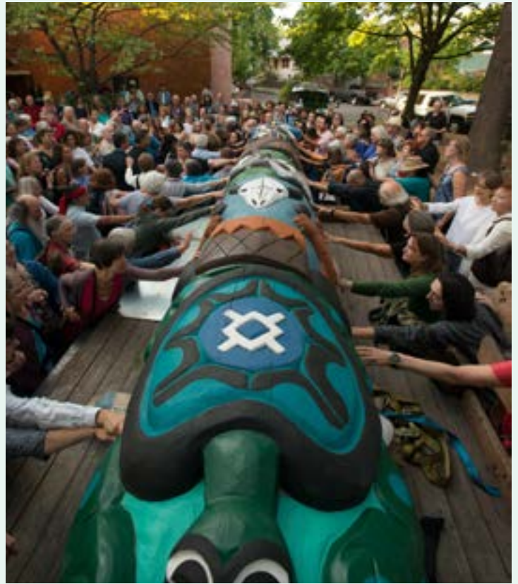
COMMUNITY BLESSING UNITARIAN UNIVERSALIST, CHURCH OF SPOKANE, 2015

These journeys informed communities and strengthened and expanded cooperation between tribes, intertribal organizations, the faith-based community, environmentalists and community leaders in the Pacific Northwest and Canada that are opposed to the proposed export of fossil fuels from Oregon, Washington, and British Columbia.