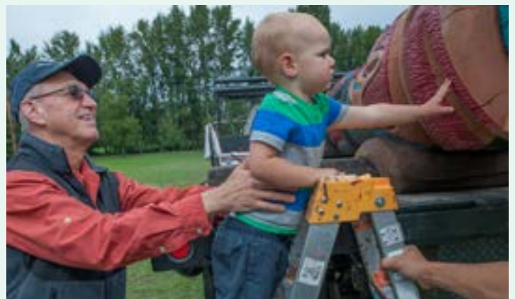
INTER-GENERATIONAL BLESSING 2013