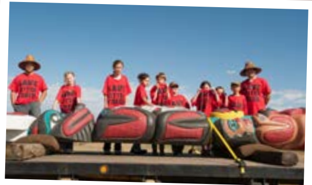
Lummi Community with Northern Cheyenne Community members highlighting the protection of Otter Creek 2013 from coal mining