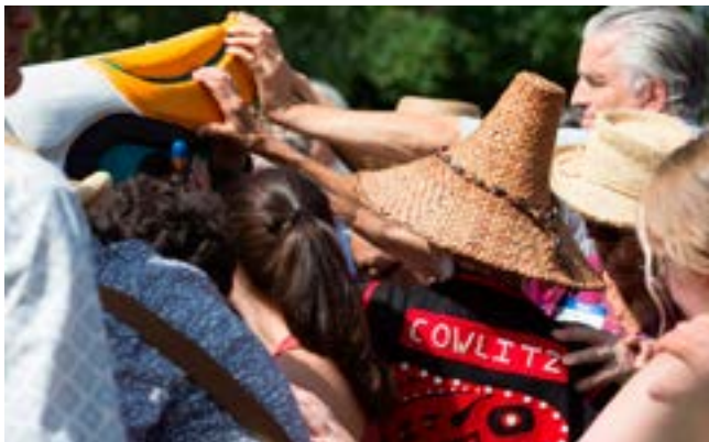
Cowlitz Tribe support at Stephens Episcopal Church, Longview, 2015